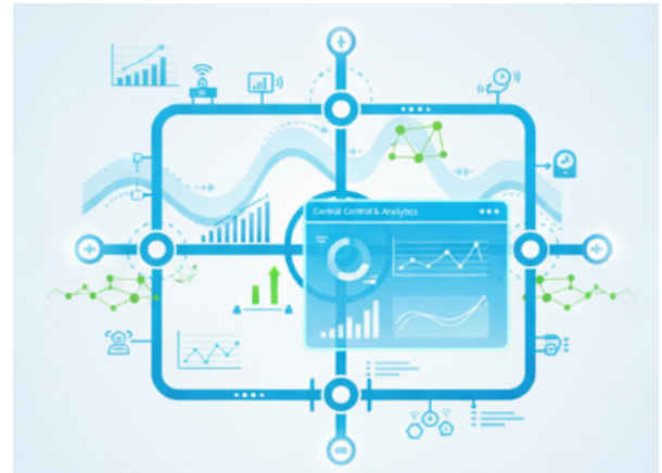
Fig. Machine Learning for Smart Gas Networks: Visualising Data Analytics and Predictive Insights (AI-generated image)

WP3 aims to assess the feasibility and possibility of integrating Machine Learning (ML), in smart metering and monitoring systems used in gas grids. The activities will provide guidance with a proposed workflow on how to set up, train, and validate ML models for gas grid monitoring and measurement in a way that the outcome gives input for existing guidelines and standards.